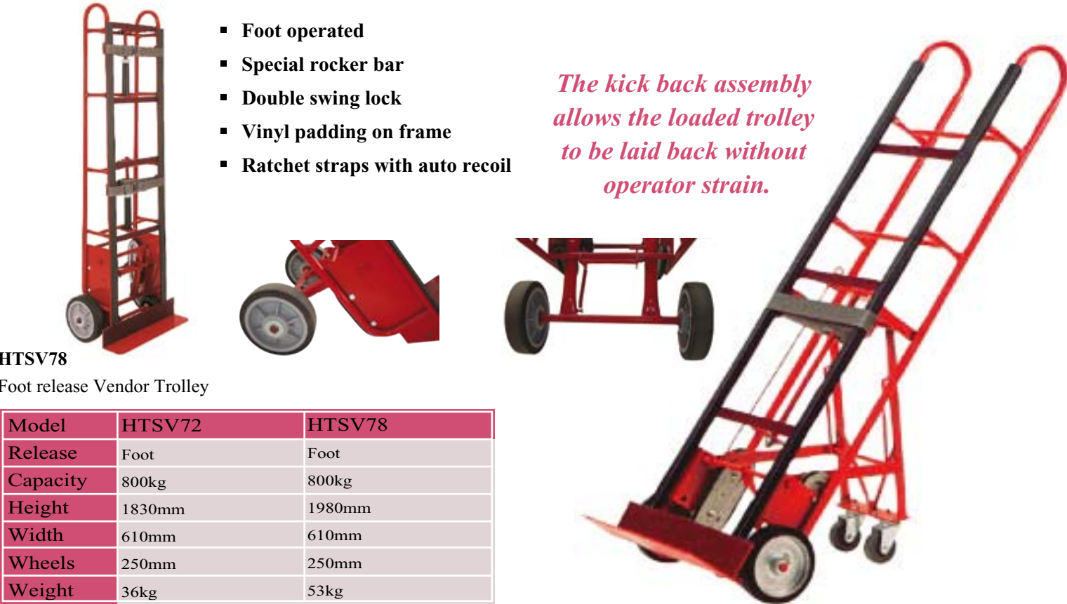
HTSV78 Foot release Vendor Trolley

Designed to Handle the Largest of Vending Machines and Commerical Refrigerators.