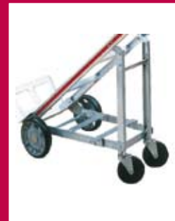
4th Wheel Kit

301050 125mm castor wheels support load in incline position.