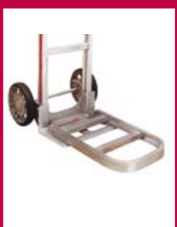
Folding Nose F2