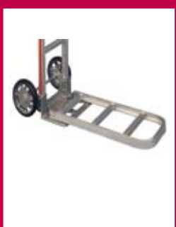
Folding Nose F3