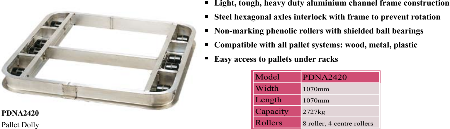
PDNA2420 Pallet Dolly