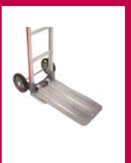
Folding Nose F1

301050 125mm castor wheels support load in incline position.