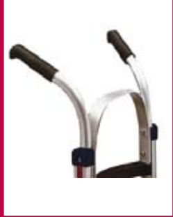
Double Grip Handle

30100 Standard pram handle very easy to use