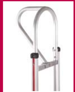
Single Grip Handle